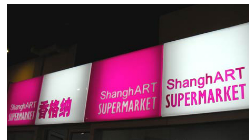
Xu Zhen, Shanghart Supermarket (2007)

(Surprisingly, given the recent sky-rocketing auction prices for Chinese painting, Chinese art seemed thin on the ground elsewhere in Miami.)